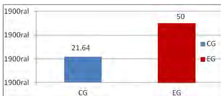
Figure 3. The levels of knowledge acquisition of the pupils participating in the experiment (EG – experimental group, CG – control group, after the experiment)

Thus, we assessed the level of knowledge acquisition by the pupils involved in the experiment and determined that their knowledge had increased by the end of the experiment (Figure 3).