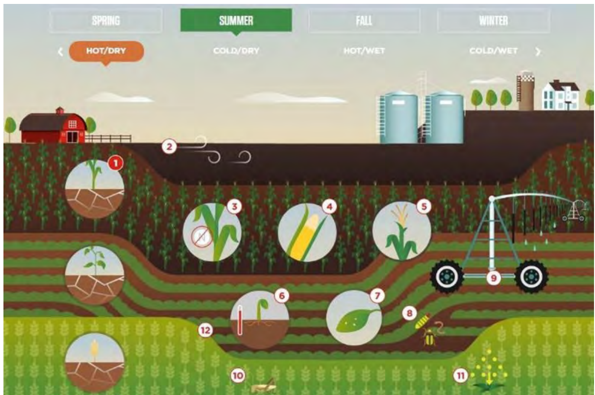
Figure 2. Cropping scenarios and impacts.