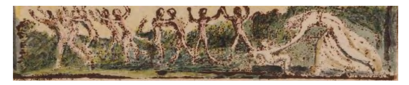
Figure 3. The image at the bottom of "The Chimney Sweeper" (Songs of Innocence and of Experience, Copy L).

Chimney Sweeper and then to share it aloud often results in students voicing competing interpretations. 11 Highlighting this divergence of readings, I ask students to consider whether the possibility of a sinister reading of the image could undercut the apparently hopeful ending of the poem (which many students initially take at face value). Leading questions about the position of the image – which one of my students characterized as "squished down on the bottom" – can help them see how even the layout of Blake's plates can carry meaning, here suggesting a parallel between the "confinement of the image" and the "social position of the chimney sweeps" (Leporati 95).