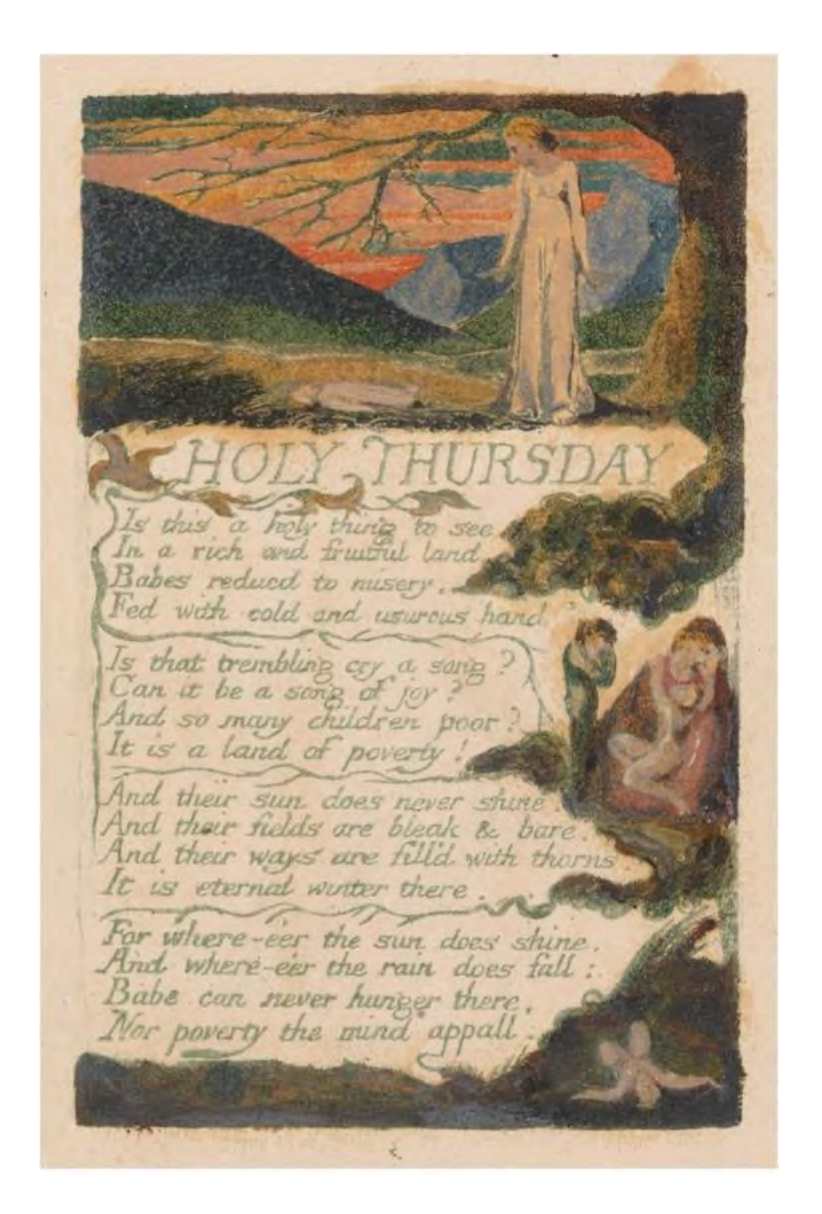
Figure 4. "Holy Thursday" (Songs of Innocence and of Experience, Copy F).

In one discussion of this poem, the class's attention was first drawn to the apparently dead child that crowns the plate. Several students commented that they thought the child was a stone. Reading the poem clarified the image, yet the ambiguity of the image further contributed