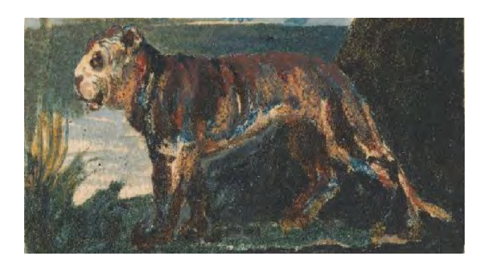
Figure 2. "The Tyger" (Songs of Innocence and of Experience, Copy F). The illustration of the titular creature looks friendly, challenging the perspective of the poem's speaker.

Elsewhere in Blake's oeuvre , images function more straightforwardly. For instance, the scene that decorates the bottom of "The Chimney Sweeper" from Songs of Innocence (Figure 3) appears to be an illustration of a sweeper's dream recounted on lines 10-20, in which children are freed from "coffins of black" by an angel and rejoice on a "green plain" near a river (Il. 12, 15). Yet even this image may be read ironically: the figures of this scene appear to be dancing joyously, but they can also be interpreted as fighting. The blend of serene and sinister tones nicely complements the ironic text of the poem, in which an innocent (naïve) speaker celebrates the consolation provided to the working poor by promises of an afterlife. Though the exploited children of the poem are thereby comforted and encouraged to "do their duty," both the poem and its companion piece in Songs of Experience clarify the extent to which such religious beliefs serve as tools for the ruling classes to keep the poor content with their miserable lives on earth. As I have discussed in an article in The CEA Critic , attention to Blake's images enriches classroom discussions: asking students first to write down a description of the illustration of The