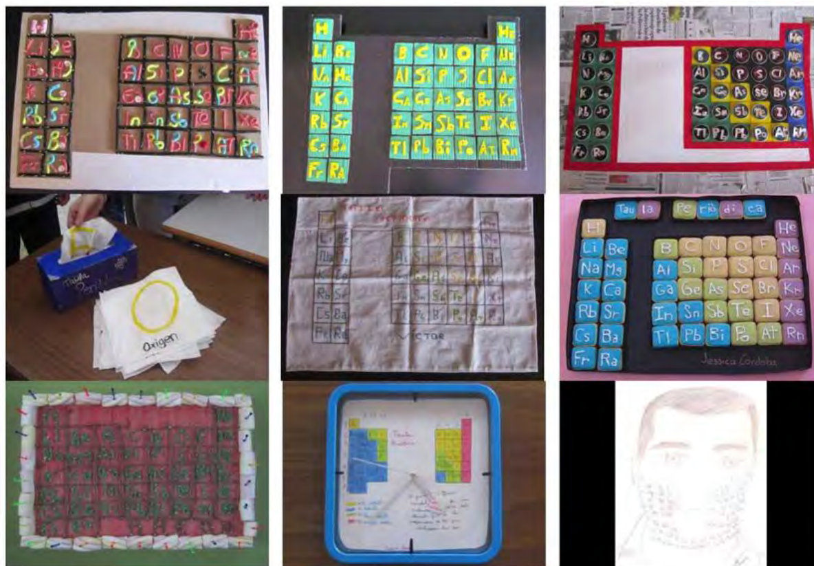
Figure 3. Different examples of projects not related to the game

From a coeducational point of view, it was also noticeable that boys submitted a cross-stitch periodic table, or girls submitted a motorcycle-related periodic table; which clearly challenged some gender related stereotypes.