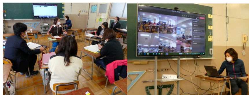
Figure 4. Exchange of opinions with colleagues in other classrooms using the video conferencing system.