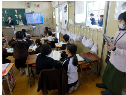
Figure 3. Teachers observing classes from the corrido.

Lesson study, which forms the core of this model, is based on observations of a research lesson. However, the spread of COVID-19 made this difficult. Many teachers were unable to enter the classroom while maintaining social distance. Therefore, some teachers were permitted to enter the classroom where the research lesson was being held, but others were forced to observe it from the corridor next to the classroom (Figure 3). In some schools, teachers acting as photographers entered the classroom and distributed the classes to teachers in other spaces over the network. The same applies to the discussion after the research lesson. The teachers were divided into several classrooms and used a video conferencing system to exchange opinions on the research lesson (Figure 4).