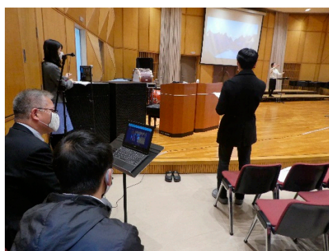
Figure 5. Delivery of research lessons to teachers at other schools using a video conferencing system.

Figure 5 shows a high school music class being distributed to music teachers at other schools through a video conferencing system. Generally, in Japanese high schools, there are not many teachers who belong to the music department. Therefore, it is difficult to form a community within the school to learn about music lessons. Securing opportunities to exchange views on music lesson creation across schools has never been easier. This is because it was difficult for teachers to overcome the problems of having someone replace their lessons and taking time to move. With a digital environment that makes it relatively easy to do, teachers are promoting lesson studies across schools.