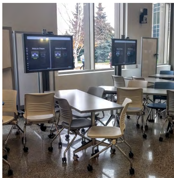
Figure 1: Room setup for tutorial sessions, arranged to accommodate two groups of 4 students per touchscreen.

During the tutorial, students worked in self-selected groups of four, with every two groups sharing a single touchscreen that displayed two side-by-side web browser windows open to the Molecule Shapes sim (Figure 1).