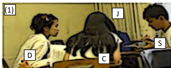
Extract 3. Weaknesses of the article

64 S: um (.) (1) but if you look at the results (.) at the table (.) one, (.) 65 C: umhm