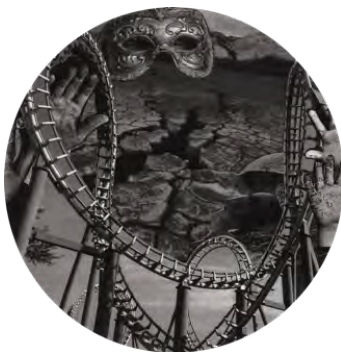
Fig. 2: Doubt collage, black and white