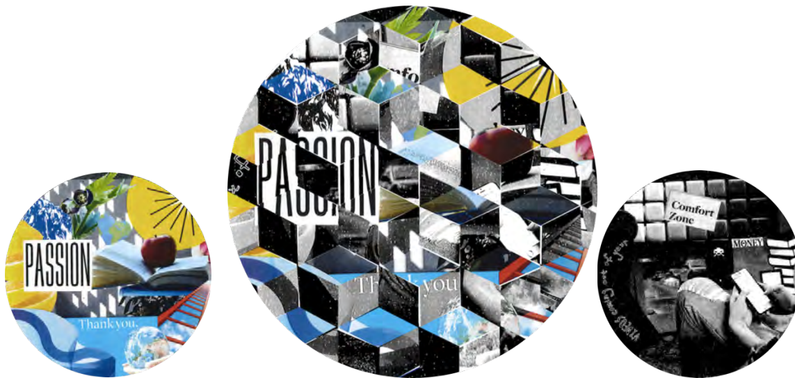
Fig. 8: Prism of Possibility collage series by Katherine Carranza

Learning can be as elementary as going up a ladder, one step at a time. From the moment we open our eyes into this world, we begin learning every day. As an educator, we must understand the individual learning process of our students and how we may scaffold their understanding to ultimately reach success.