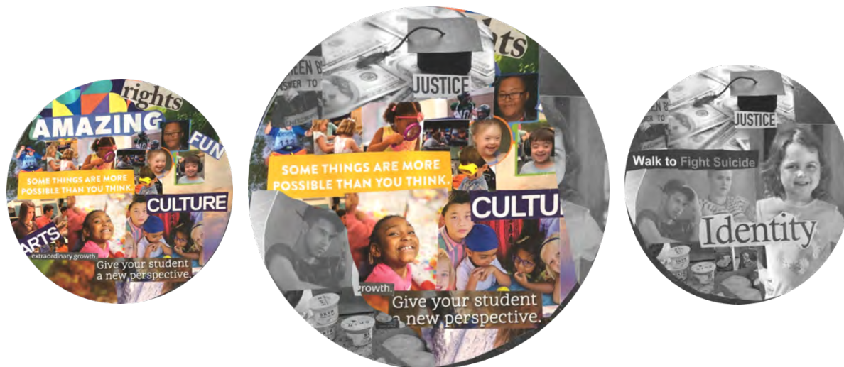
Fig. 6: Lifelong Learner collage series by Pat Baybayan

Learning can be as fun as a game. Just like a game, learning should keep everyone engaged and on their feet. Students or players should be able to work together, but also be able to make meaning out of their individual experiences. Even though games and learning may feel competitive at times, at the end of the day, it should be enjoyable, fair, and accessible to everyone.