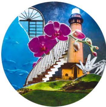
Fig. 1: Hope collage, full colour

In this workshop, I walked students through the process of selecting images that resonated (or not) with them in response to the big question posed for each collage. I also modelled techniques for cutting, layering, and gluing images down on the circle templates provided for each collage. In order to flatten the seams between images in each collage, we scanned the finished hope collages in colour (Figure 1) and the finished doubt collages in black and white (Figure 2).