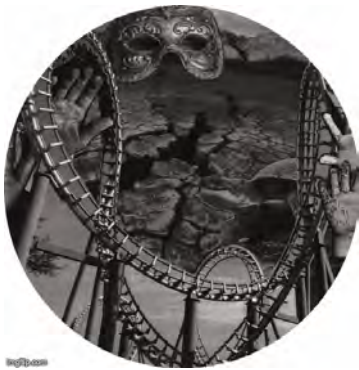
Fig. 5: Ever unfinished GIF ( https://imgflip.com/gif/3smhci )

I created a sample GIF using my own Hope and Fear collages (Figure 5) using the following free GIF maker: https://imgflip.com/gif-maker .