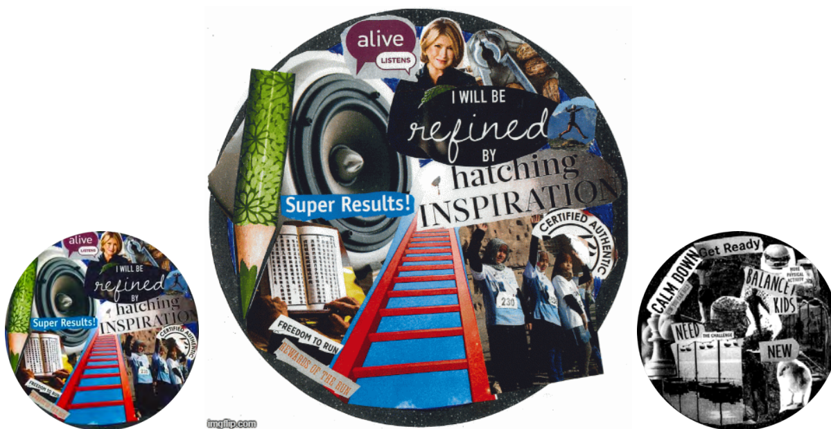
Fig. 11: From the Outside Looking In collage series by Yann Myslowski

Learning can be as easy as listening, reading, and writing, but can also be as hard as climbing a fence, hiking a mountain, or walking a tightrope. From the outside looking in, learning can be like a perfect balance of uncertainty and inspiration. As a future educator, I’m uncertain about what subjects and grade levels I will end up teaching, but I’m equally inspired by the sheer amount of learning both my students and I will be doing together along the way.