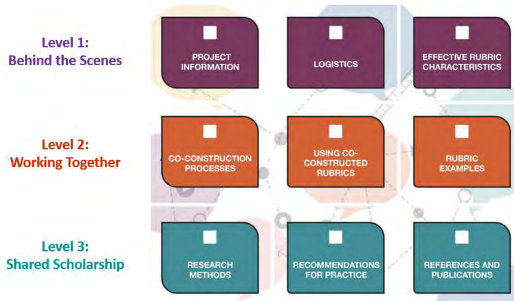
The Model of Collaborative Rubric Construction