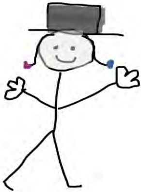
The Welcoming Mayor of “Essay Land” With 3 Fingers on Each Hand

When she introduced “Essay Land”, she invited students to “enter and learn the language, because the Mayor invited them and knew they would be awesome Essay