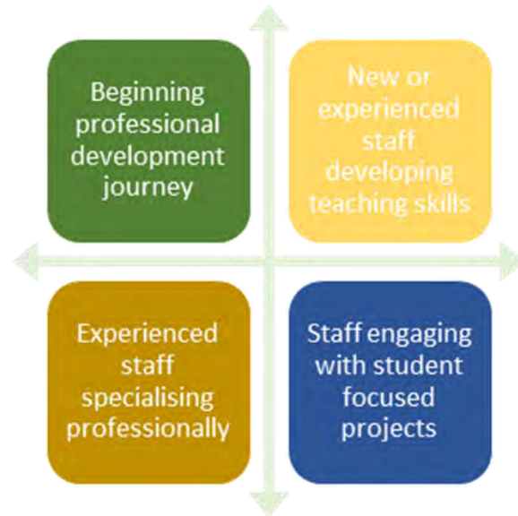
Figure 2. Badges Ecosystem: pathways for PD open-access courses

Staff who want to begin their professional development journey using the PDF as their guide are encouraged to take the following two open courses: