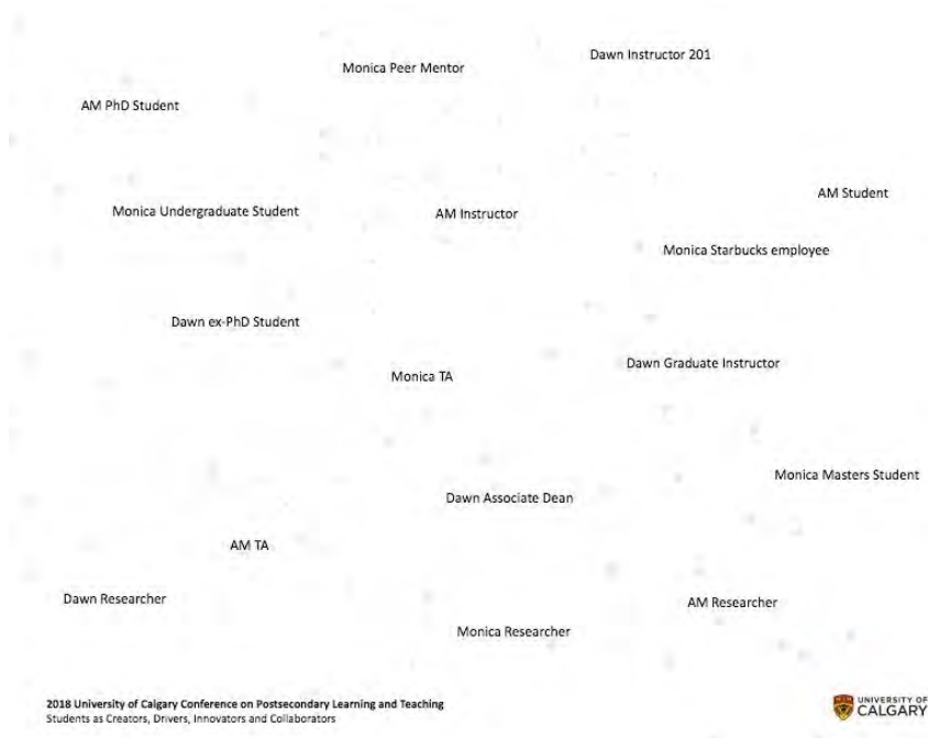
Figure 1. Movements in mentorship identity mapping stage one.