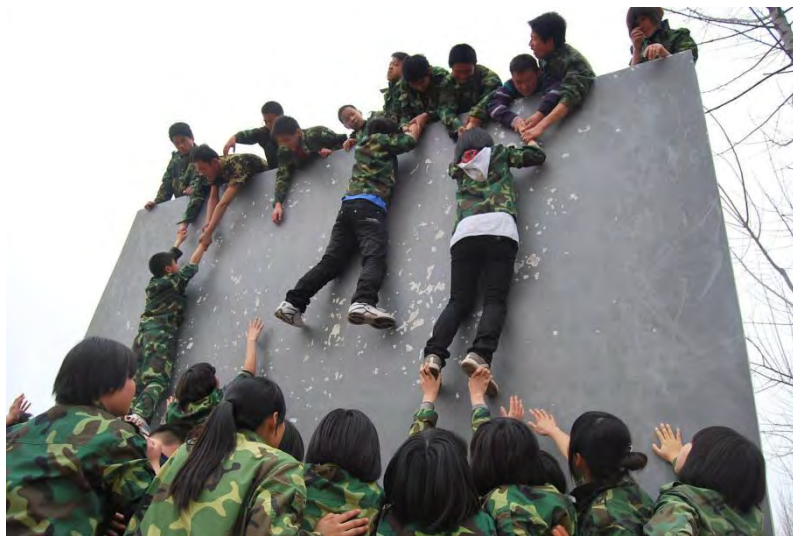
Figure 2. The Seventh Graders are Crossing the "Graduation Wall".

this kind of high-pressure control, once, a girl suddenly fainted. Because of a sudden incident, everyone was caught off guard and swarmed; some people pinched Renzhong acupuncture point, and some people performed cardiopulmonary resuscitation; there were no boys and girls scrupulous at the time, and then a boy picked the girl up. So I took her to the hospital. After that, the opening scene appeared. Later, experts suggested that the school demolish the wall between male and female dormitories, promote regular exchanges between male and female students, and carry out ballroom dancing activities. This phenomenon has never happened again.