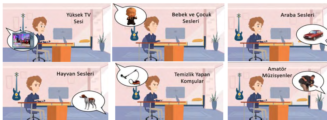
Figure 5. Problems in organizing the working environment during the emergency remote teaching

Under the category of organization of the work environment; the pre-service teachers complained that they could not find a suitable working environment. One of the participants expressed his opinion as follows. “Lack of finding a quite environment to listen the class. If I need to give an example from myself: I have six siblings, my parents, and my grandmother living in the house. Moreover, my uncles and aunts come home all the time” (S2, Questionnaire). The screenshots of the digital story prepared by one of the participants about the problems related to the working environment are shown in Figure 6.