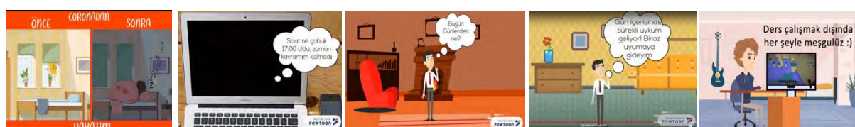
Figure 4. Sample screenshots of time management during the emergency remote teaching

The pre-service teachers stated that unlike face-to-face education in distance education, students cannot use their time efficiently due to the fact that they can follow the lessons whenever they want, and the home environment is too much comfortable. The pre-service teachers stated that they use the time they spend for transportation to the university campus to leisure activities. For example, they got busy with activities such as watching television and playing computer games at home, instead of using the time efficiently. They also stated that they were confused about the concept of time and day due to being at home all the time. Sample screenshots of the problems experienced by the pre-service teachers regarding time management during the emergency remote teaching are shown in Figure 4.