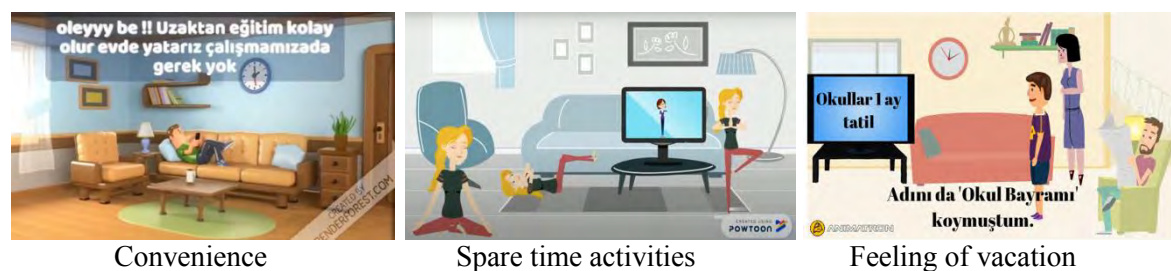
Figure 1. Sample screenshots from digital stories about pre-service teachers' expectations/thoughts at the beginning of the distance learning process

With the announcement made by Council of Higher Education (2020) that education at all universities was suspended, most of the pre-service teachers in this study made a perception that universities would be on a vacation for the rest of the semester. In addition, a few participants stated that the distance education process would be economical since there would be no transportation and food expenses that they usually spend when they have face-to-face classes. Figure 1 shows sample screenshots from the digital stories of pre-service teachers.