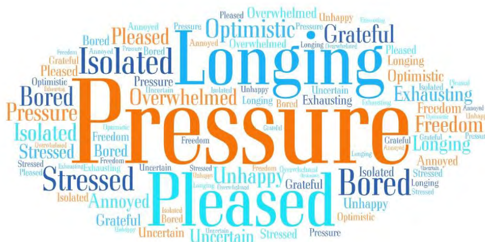
Figure 6. The emotions that the pre-service teachers expressed in their digital stories

Most of the participants stated that they had difficulties during the emergency remote teaching process. The reasons that cause pre-service teachers to have difficulty in the process are: having too many homework and projects, technical problems, difficulty in finding a suitable study environment, difficulty in understanding the course content or homework, and difficulty in communicating with the instructors and friends. Participants described themselves as overwhelmed, exhausted and stressed in this situation. Participants felt lonely due to staying at home and longed for their friends, school environment and social life at campus. In addition, it is found that the pre-service teachers were satisfied with the continuation of the education process and were hopeful about the future, despite the difficulties and motivation issues they have experienced during this process.