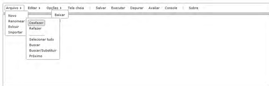
Fig. 3. VPL-Moodle menu and execution options.

Cronbach's alpha legitimizes the reliability of the questionnaire's replies with \alpha = 0.8555 for CS1 and \alpha = 0.7959 for CS2 (both above the minimum of 0.7). As it can be seen in Table 1, all factors presented relatively low averages with means ranging from 2.8108 to 3.8788. To consider the usability of the interface as satisfactory, mean values should be greater than 3.6 since the value seems to be a better estimate of "neutral" or "average" subjective satisfaction (Nielsen and Levy, 1994). The highest average of the factors is the learnability factor for CS1 ( M = 3.8788 ) and, the control factor for CS2 ( M = 3.3063 ). The learnability in CS2 ( M = 3.2523 ) is close to the control factor. It is interesting to note that the VPL-Moodle interface is relatively simple for the students, having no more than one suspended menu and a text editor, as shown in Fig. 3. In VPL-Moodle the lecturer can select which "execution" options are offered to the students (execute, debug and evaluate), in the present work the lecturer chooses only the execute (it opens a terminal window and executes the code. The student can interact, if the code allows it.) and the evaluate options (VPL-Moodle automatically evaluates the code with input and output cases).