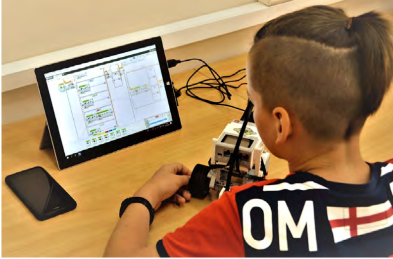
Fig. 4. Solving a line follower problem. Programming activity by an 11-year-old participant.

In the last session of the robotics course, participants are focused on learning programming using a space challenge contest. The space challenge playing field includes eight missions ( The Lego group, 2020 ), i.e. communications station, satellite flight crew, crater and MSL, rock samples, solar panel, rocket and launcher, and mars outpost. All these missions (see Fig. 5) should be performed during the last session (2.15 clock hours). After the space challenge activity, each student chooses the achievement badge