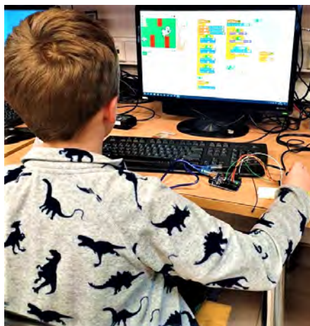
Fig. 6. A 10-year-old participant programming the maze. The creation process involves red barriers which will send a sprite to the beginning of the game-play if it comes in contact with them. The movement of the main character is implemented using a joystick.

As mentioned in (Dukish, 2018), a modern technologist should not only appreciate and understand general scientific concepts, but also be able to apply them to the everyday world. The Phase 3 programming courses with the DGBL approach can be thought of as a body of knowledge with electronics technology being the practical application of that knowledge. Arduino programming is introduced after a session dedicated to the study of some physical concepts, such as electrical current, resistance, voltage, and the relationship between them, i.e. the Ohm law. In the next sessions, students get a taste of the Arduino electronics; as a result, they are able to create simple projects using the Mblock environment, e.g. blinking LEDs, using a push button to switch LEDs, RGB LEDs, measuring ambient temperature and humidity, air pollution monitoring system etc. Using the Mblock environment with the DGBL approach, participants implement these simple projects and create more sophisticated games, such as traffic lights for sprites, maze-like games with a remotely controlled sprite (see Fig. 6), or an LCD screen game where a sprite jumps over hills and ducks under birds. During the Arduino continuation course, students increase their programming skills through the creation of advanced games, i.e. a classic snake game using a LED matrix and a joystick (see Fig. 7), a touch tic-tac-toe game, a tetris game using a LED matrix and a gyro sensor.