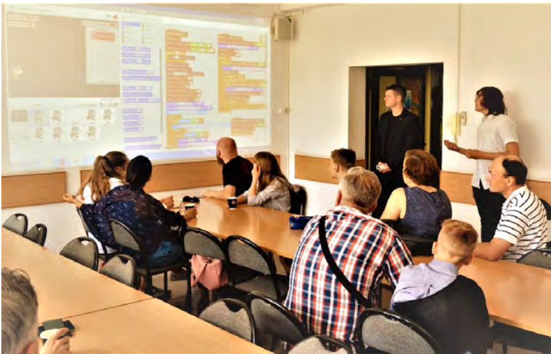
Fig. 3. The final Scratch game presentation by a 14-year-old participant.

game space. Finally, by using the DGBL approach the participants learn how to implement algorithms for intelligent bots and dynamic rendered backgrounds in their computer pieces of art.