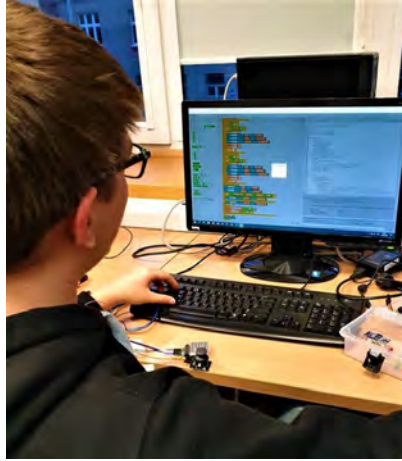
Fig. 7. A 13-year-old participant programming the snake game. To make this game, a participant uses an 8×8 LED matrix for displaying the snake and its food and a joystick for moving in selected directions

The Arduino advanced course requires similar DGBL activities performed in the Arduino IDE text-based environment. The reproduction of visual blocks during the Arduino advanced course in a text form leaves out an important element of the experience of programming such as “seeing the same code from different perspectives” (Dickes and Farris, 2019).