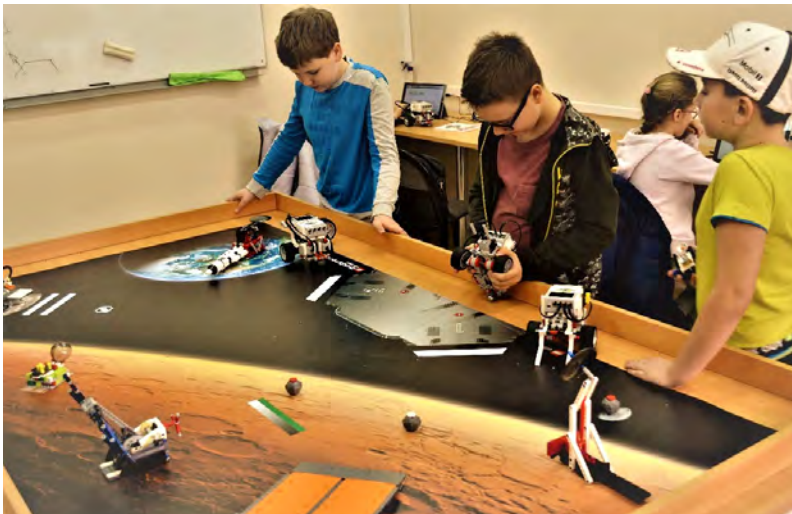
Fig. 5. The space challenge inspection activity performed by a group of 10/11-year-old participants.

In the last session of the robotics course, participants are focused on learning programming using a space challenge contest. The space challenge playing field includes eight missions ( The Lego group, 2020 ), i.e. communications station, satellite flight crew, crater and MSL, rock samples, solar panel, rocket and launcher, and mars outpost. All these missions (see Fig. 5) should be performed during the last session (2.15 clock hours). After the space challenge activity, each student chooses the achievement badge