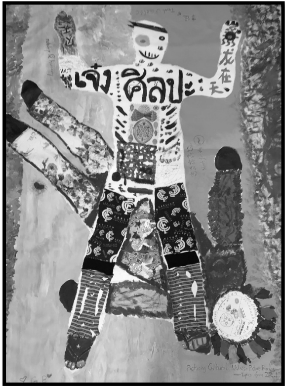
Figure 1: "Weak legs" 108

These reflections on the effects of COVID-19 on their lives as international students were reimaged on their body maps. Figure 1 shows a body map of a person with a white torso and blue and black covering on the legs. Of importance here is the bottom part of the pair of legs. The student reflected on his current situation and explained that he placed the black striped material on the bottom half of the legs and made holes in them to show, although his legs are strong, the isolation and uncertainty of COVID-19 is weakening him. The participant in this image also likened the striped material to his thesis drafts and the holes represented the edits his supervisors did to his work.