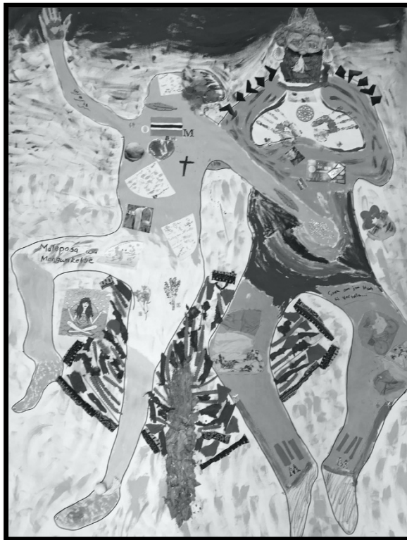
Figure 2: "My red heart"

The higher degree students also were worried about what would happen in terms of employment once they completed their studies. As post-graduate students they were all very passionate about their areas of study and making a difference in their communities. Their love of their home countries was a large focus in their reflective artworks.