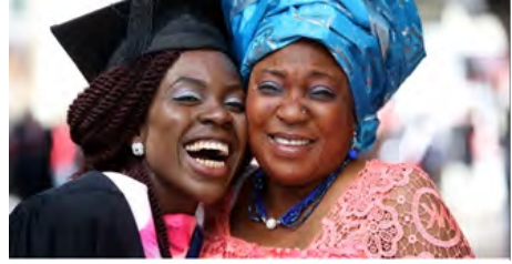
Fig. 2: Cardiff, U.K.