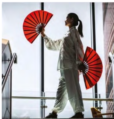
Fig. 5: De Montfort, U.K.