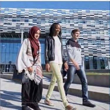
Fig. 3: Manchester Metropolitan, U.K.