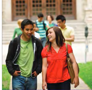
Fig. 4: Western, Canada

Figure 4 appears on the cover of the strategy from Western University (Canada, 2014). This photo, like the others, seems designed to highlight a harmonious, diverse campus by representing a number of Asian students (some blurred out) mingling well with white students on campus. The image focuses on a man, who appears to be of East Asian heritage, and a young white woman smiling and chatting. As with Figures 1, 2 and 3, these students may not be international, but they do convey a sense of opportunities for positive interactions with members of different genders, and those from different racial, ethnic or religious backgrounds.