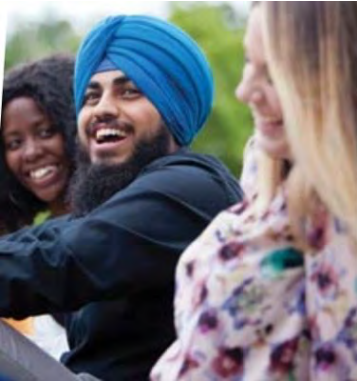
Fig. 1: Vancouver Island, Canada

background is not clear. As with Figure 1, this photo seems designed to present an image of an institution that celebrates and welcomes religious, ethnic, and national diversity.