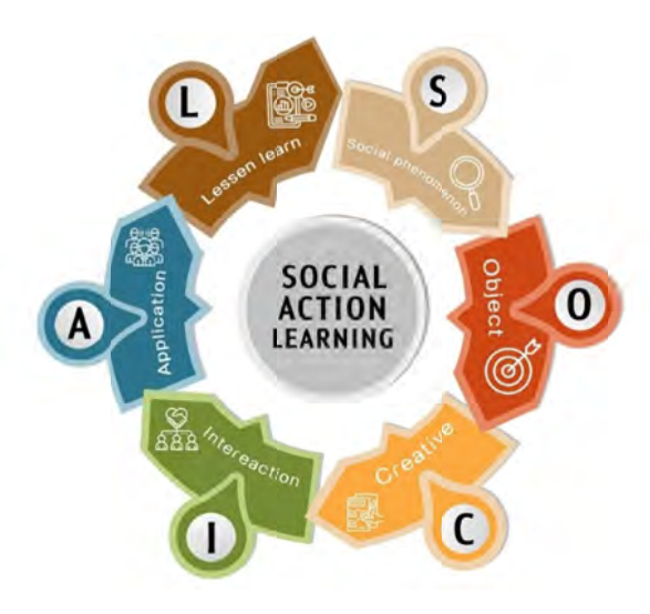
Figure 2. SOCIAL Action Leaning (SAL)

Having designed and developed the handbook, essential finding is the outcome of participatory action learning, "SOCIAL Action Learning Model", as having