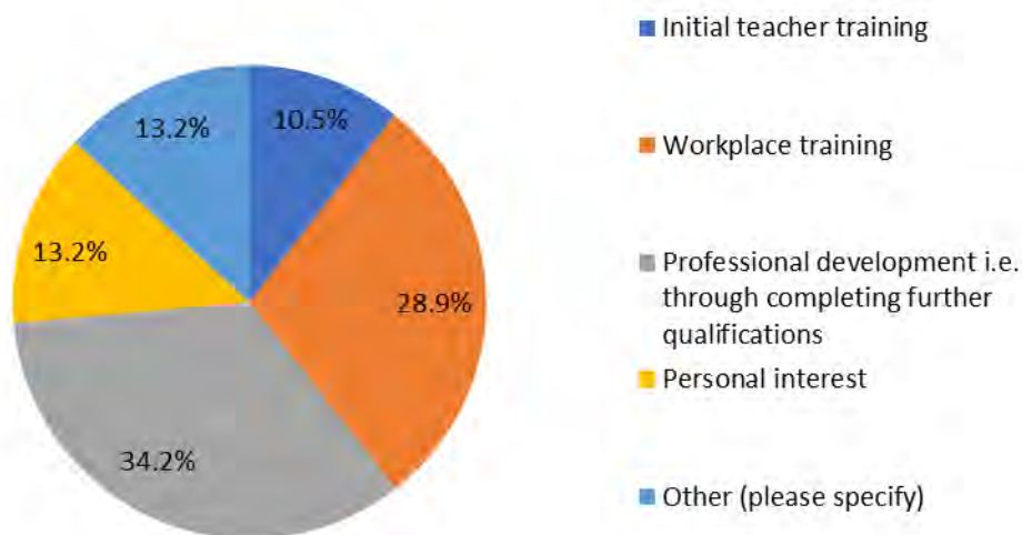
Figure 1: Where respondents primarily obtained their knowledge of IL