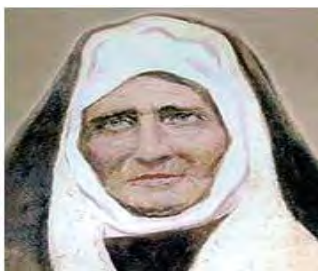
Image 3. Heroine Nene Hatun

An example of this situation is in image 3 (MEB, 2019c, p.118) in the 11th-grade history textbook in the text "Kahraman Nene Hatun at the 93 War" .... Although her husband told her to stay, take care of the child," Nene Hatun entrusted her child to God and joined the crowd... After the Korean War, General Ridgway, a NATO officer in Erzurum, visited Nene Hatun at her home and kissed her hand. "I did my duty at the time," she told Ridgway, who visited her. Today, despite my advanced age, I have the strength and excitement to do the same service in a more perfect way. " once again, she showed the spirit of the heroic Turkish woman " , showing the example of a woman who put the defense of the homeland before her other roles. Considering the general context of the text and the language structure of the text and the picture used, the roles were concretized through exemplary historical figures and stories, starting from the historical background.