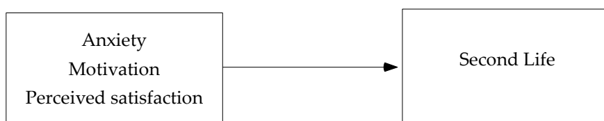
Figure 1: Conceptual framework adopted from Christopoulos, (Aydin, 2013).

English language in distance education program seems to be problematic specifically at Deanship of distance education - Sudan University of Technology and Science (SUST) due to lack of oral communication, a conducive environment and social interaction among the learners during consultations hours. Furthermore, learners may increase their English language oral communication by many means such as animation interactive environment and mitigate their anxiety towards oral communication. They will to increase their motivation. Moreover, there is a serious lack of research on the utilized Second Life as English Foreign Language learning environment (Aydin, 2013).