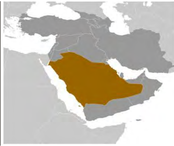
Figure 2. Saudi Arabia Location