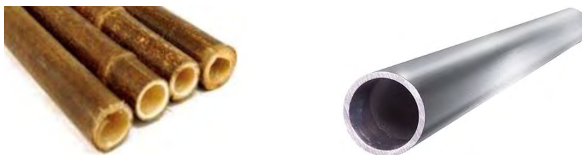
Figure 2. Cylindrical pieces of bamboo and aluminium

of a cylinder. I exhibited solid models of cylinders by showing them an aluminum pipe (that was cylindrical) and another piece of bamboo, which was cylindrical, shown in Figure 2.