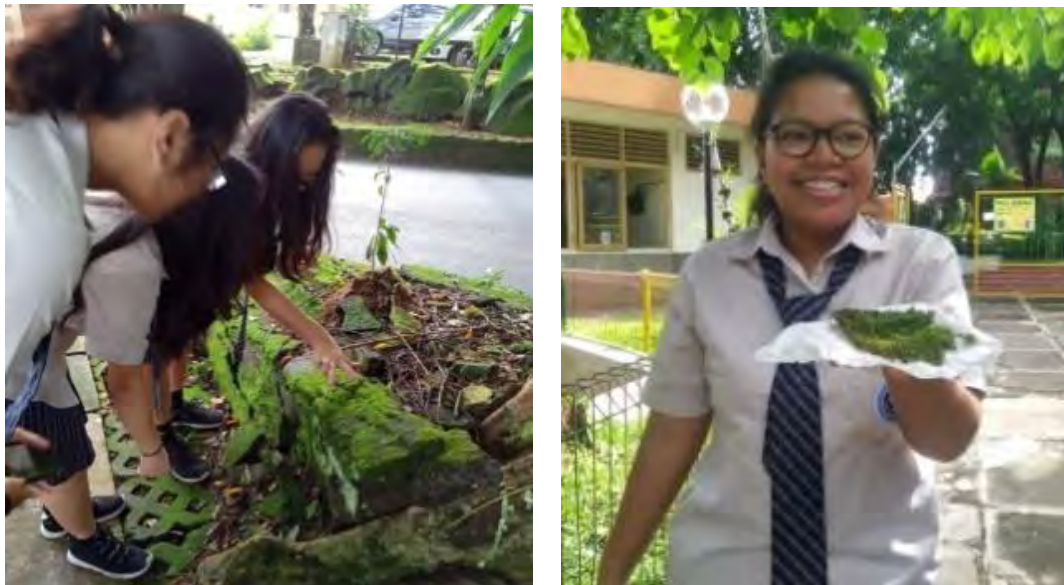
Figure 2. Students' activities to get Bryophyta sample as scientific evidence

Student learning activities (Figure 2) showed that students are invited to link contextual learning to Bryophyta's subject. This activity affected increasing scientific literacy. Increased scientific literacy indicates that students have a curiosity about science issues and practice science directly. When students pay attention to their learning behavior, it can be empowering their experiences and form scientific expertise from various sources using scientific methods. Dragoş and Mih (2015) explained students could achieve their learn best if they could employ a variety of data collection methods. Moreover, setting up an outdoor class as a learning activity will allow students to observe the phenomena by themselves and empower their scientific abilities to be more optimal ( Feille, 2017 ; Fettahlioğlu & Aydoğdu, 2020 ).