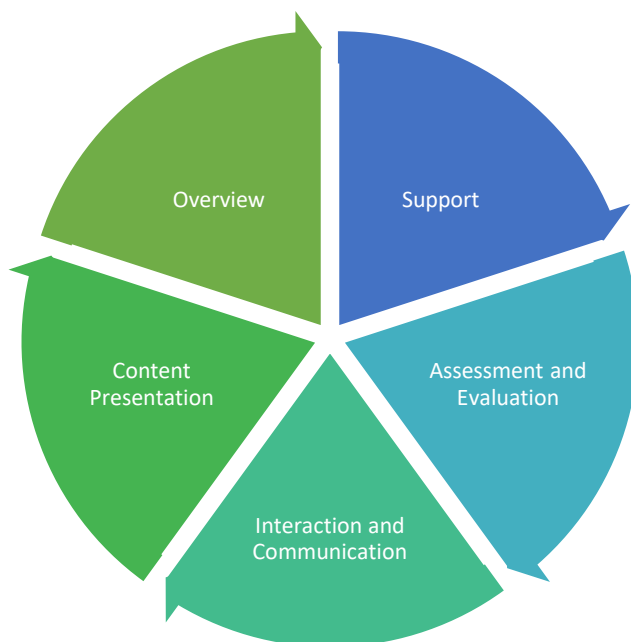
Online Course Design Elements Framework