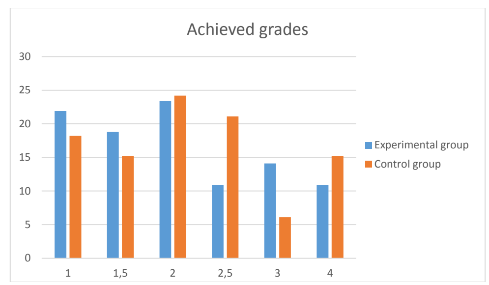
Figure 1. A graphic representation of the achieved grades.

Table 3 shows the finding: At the significance level of 5% ( \alpha = 0.05), the hypothesis H<sub>1</sub> was rejected because the probability p > \alpha , that is, the difference between the experimental and the control groups is not significant in the grades achieved in an idiomatic test.