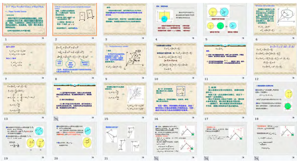
Figure 2. PowerPoint courseware of §3.7

mechanics can render students' independent learning more holistic, systematic, and challenging.