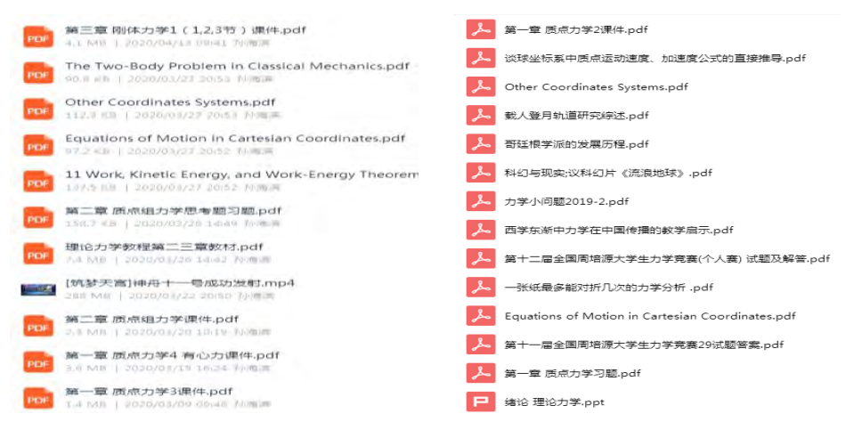
Figure 1. Learning materials of the theoretical mechanics online course group

Based on the general background of online teaching, a learner analysis was conducted to fully inspect the cognitive characteristics and patterns, basic knowledge, capabilities, and psychological conditions of the target students (i.e., year two college students majoring in physics) and analyze and predict the reasons that they might experience confusion and encounter obstacles at school. This aimed to find the right antidotes for solving students' learning difficulties during teaching practices. Given that the students were studying at home and lacked access to learning materials, materials closely related to the course were uploaded to the course group in advance, such as electronic versions of teaching materials provided by publishers, courseware, popular science and English literature on mechanics, and topics in mechanics competitions for college students. This not only facilitated the students' independent learning but also eased the limitations they faced in terms of wireless data usage. Figure 1 is part of the learning materials we provide for students' online learning.