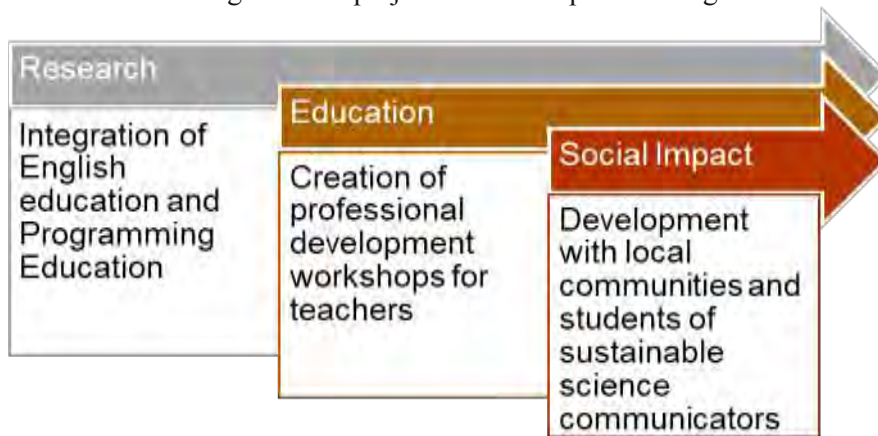
Figure 1: The implementation of Sustainable Programming Education.

Saturday similarly so that regular work and school schedules would not interfere. The local Ministry of Education in the Akita prefecture provided their continuous support for these trials, along with that of Akita International University administration. Based on the findings from the trials, a participatory action research (Problem, Actions/Solutions, Assessment) will be incorporated for planning and implementing the full SPE project beginning in January, 2019. The project will engage an action research model combining pre-assessment, intervention preparations, intervention, and on-going assessment, as well as project evaluation. The objectives of the three-part professional development initiative includes three phases (Research, Education, and Social impact) illustrated in Figure 1. The training and implementation period will be tailored to school commissioners’ and teachers’ needs to adapt their views of teaching two required curricular subjects in an integrated manner—English and programming (See Figure 2). University students will develop and improve their skills to deliver the instruction. In turn, the PI and co-Is, with students, will deliver more workshops in schools of Akita, as well as disseminate the findings of their project work as depicted in Figure 3.