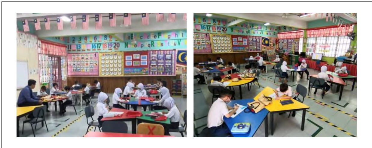
Figure 5. Limited seating for each preschoolers as following the social distancing guideline.

limited movement and touching situation between the children. Individual tasks were given to replace group work activities that may increase the interaction and movement among the preschoolers. Although individual activities may give difficulties to the children but with the assistance and guidance from the teacher, the children were able to follow the instructions given in the classroom. The teacher needs to always remind the pupils about the SOPs and the importance of it. Outdoor classroom activities were also cancel and being replaced with indoor games and activities. Nevertheless, the games and activities that being carried out were planned early and emphasised on individual movement instead of grouping actions.