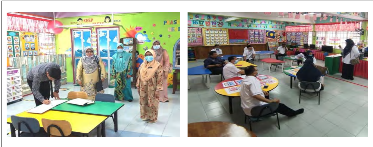
Figure 3. Meetings, discussion and inspection with pre-school administrators, teacher and Parents Teacher Association (PTA) to the pre-school centre.

There was good communication among the teacher and parents’s in providing updates and latest information regarding the SOPs conducted. This is important as parents will receive the latest updates and information pertaining their children especially about the compliance of SOPs in the preschool centre. Parents were also be seen to be active in their participation in the preschool management during the MCO period as this is the only way for them to get updates on the preschool operation.