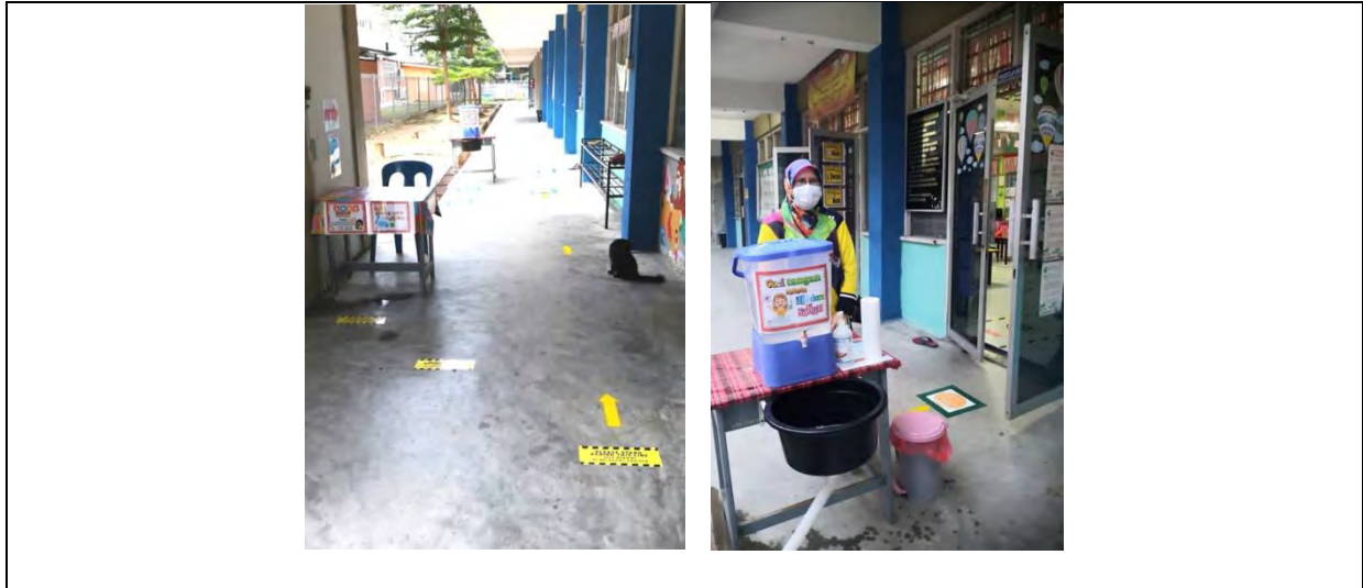
Figure 2. Preparation conducted by the teacher and administrators to welcome preschoolers during MCO period.

Although there were many preparations required such as labels, walking and pathway symbol markers, movement instructions and reminder posters and stickers, the teacher and administrators were able to prepare and display it clearly around the preschool centre for the parents, children and visitors. As for the preschoolers, big and clear posters were required as they can see it clearly and remind them of the importance of following the SOPs according to the new norm act. With the support from the administrators, the teacher burden of preparing the materials were also eased.