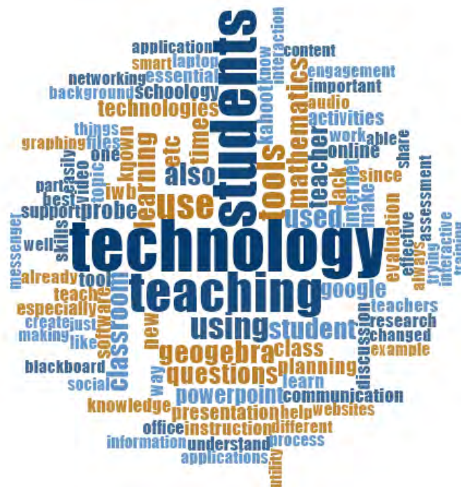
Figure 3. After intervention FGD word cloud

After the single-subject experimental set-up, FGDs were facilitated to complete the IMMD. The guide questions include six open-ended questions on the inclusion of technology in the classroom, probing questions on the quantitative analysis results. The qualitative responses were analysed using NVivo Pro, and a Word Cloud was generated using the transcripts of the FGD, as shown in Figure 3.