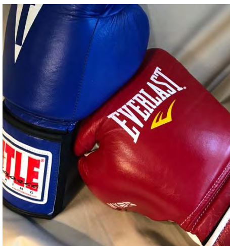
Figure 2. “Uneven Fight”

I have always felt sorry for students in poverty because I believe they have to fight for everything they need to be successful both in school and out of school. It's like they are in an uneven fight.