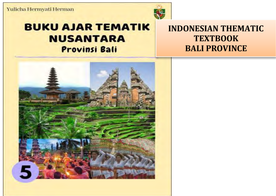
Figure 2. The example of the student submitted assignment (Indonesian version and English translation)

Prior to conduct the writing printed modular based learning materials tutorial, the students had to take pre-test regarding the entry knowledge of the writing skills. After pre-test the participants followed the tutorial session of the printed modular based learning materials writing. In this present study the participants took the post-test which related to the course objectives. The pre-test and post-test results were analyzed to get the information regarding the students gained knowledge and writing skills after learning with the mind map approach.