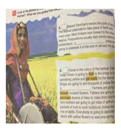
Figure 23 Figure 24 Figure 25