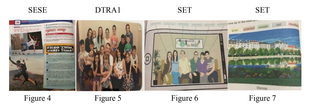
4.1.3. Visuals including different cultures

In SESE, excluding the exercises based on daily life and storyline illustrations, all visuals, such as in Figure 4, use real photographs. In DTRA1, the visuals of family members, friend relationships, eating and drinking habits, and photographs of school life as reflections of culture are all real photographs. In Figure 5, the photograph of the Radford Family appears to be a real family photo. In SET, it is seen that the visuals used, other than those of India, Japan, and China, were created using digital technologies. That the original images have low colour quality and the photographs small and far from being sharp gives the impression that the images are only intended to add colour to the pages. Family members shown in Figure 6 are only sketches, and it is almost impossible to understand that the photograph used in Figure 7 is of Vienna without reference to caption beneath the image.