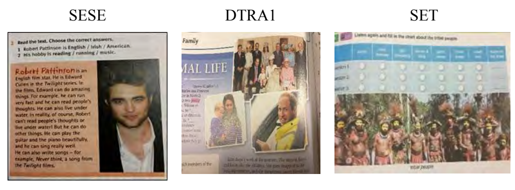
Figure 1 Figure 2 Figure 3