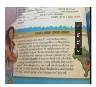
Figure 15 Figure 16 Figure 16