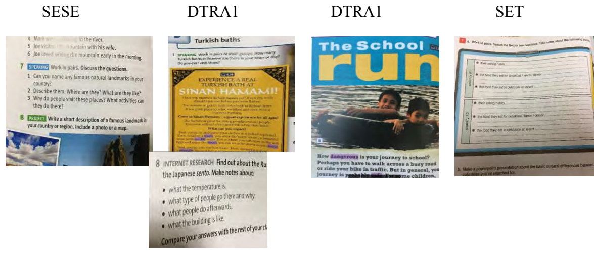
Figure 30 Figure 31 Figure 32 Figure 33