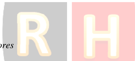
Figure 1. Differences in high and low scores