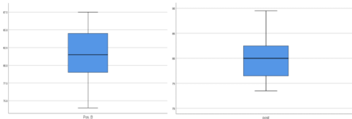
Figure 1. Outlier test of fiction group (left) and non-fiction (right) group

The data in this study fulfilled the first three statistical assumptions, namely interval data, two independent groups (fiction and non-fiction), and independent observation. To fulfill whether there are no significant outliers in both groups, the researchers ran the statistical analysis.