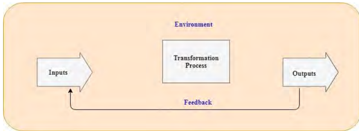
Figure 1: The input-transformation-output model

Source URL. http://www.open.edu/openlearn/money-management/management/leadership-and-management/understanding-operations-management/content-section-0