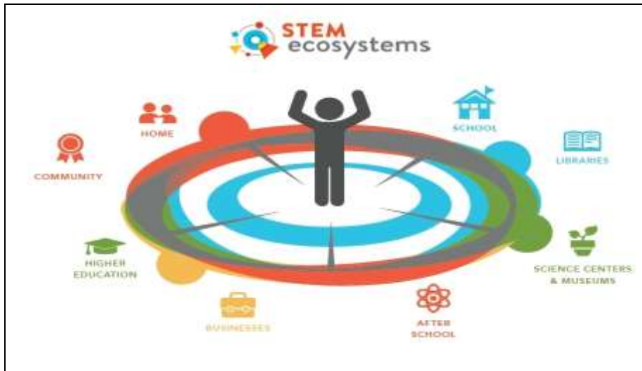
Figure 1 STEM learning ecosystem

This is done by emphasizing the direct influence of parents along with the mediator influence through the values of career demands of the STEM industry in the learners' life. Therefore, learning needs with the awareness of the value in STEM start from home and is a dynamic effort towards the success of learners in preparing themselves for the STEM industry careers in the future.