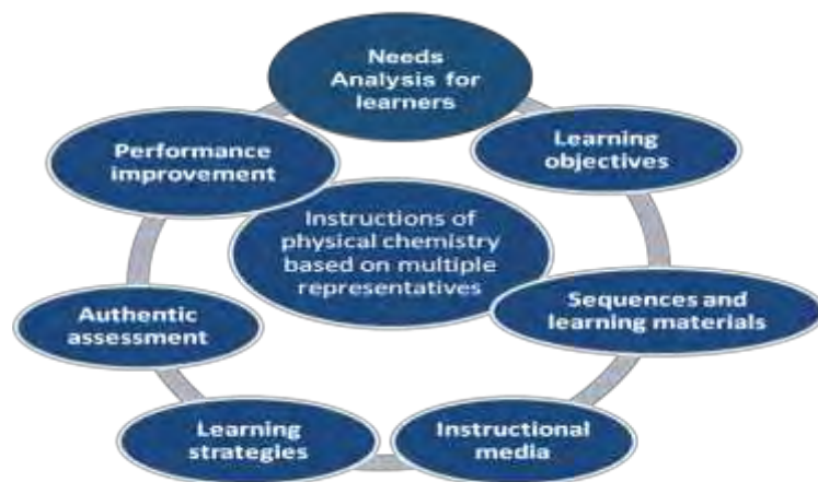
Figure 3 Components of instructional design model of physical chemistry based on multiple representatives

The instructional design model consists of several components which support one another to strengthen the learning process of physical chemistry based on multiple representatives. Each component has a section or important points to support the achievement of the instructional design model of physical chemistry based on multiple representatives. Components of the instructional design model of physical chemistry based on multiple representatives are illustrated in Figure 3.