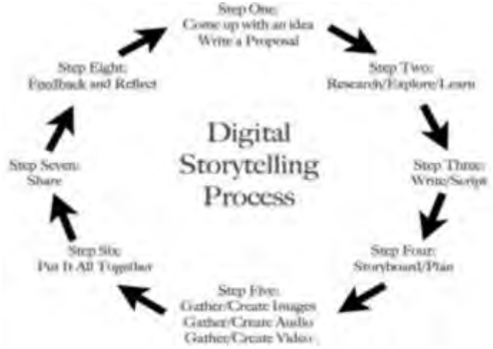
Figure 3 Digital storytelling production process

Based on the picture, the making of Digital Storytelling by students is carried out through 8 stages (Morra, 2013) as follows: