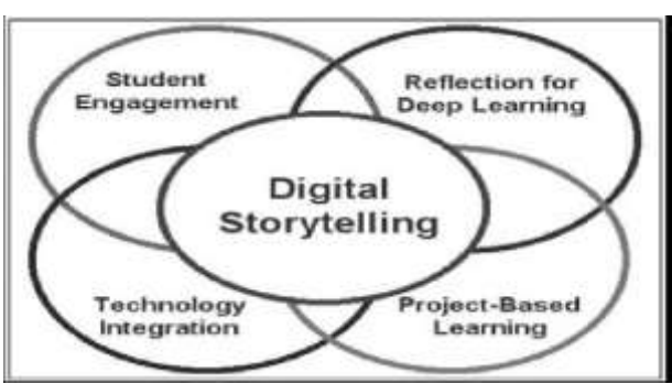
Figure 2 Convergence of Student-centered learning strategies

a. Digital storytelling is essentially a process of combining images, sounds, texts, and video to tell or describe something (Frazel, 2010; Perry, 2008). In other words, it is a new form of storytelling. In conventional storytelling, a story is written and illustrated on a piece of paper, while in digital one, a story is realized in a video equipped with sounds, images, texts, and animations making the story more appealing. In addition, digital storytelling can cover a variety of topics not limited to classic or traditional stories. The visual products can be anything, and use a variety of available software. The model embraces a digital storytelling property as an active-creative-innovative ICT-based learning media. Digital storytelling is a social studies learning media that fulfills four elements of active-creative-innovative learning (Xu, et al., 2011), namely: