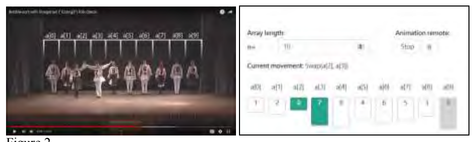
Figure 2 (a) Bubble sort with Hungarian folk dance; (b) Animating the Bubble sort algorithm.