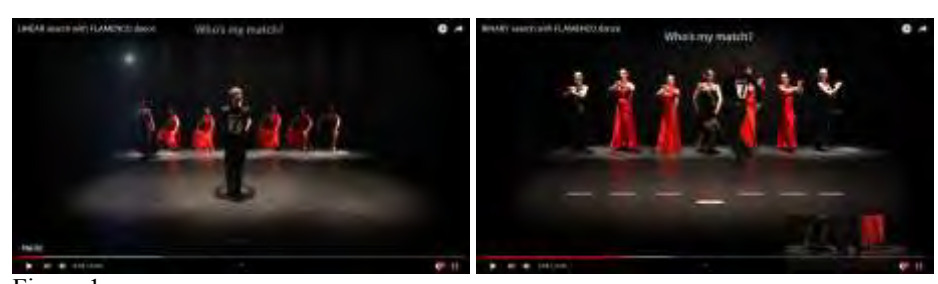
Figure 1 (a) Linear search with Flamenco dance; (b) Binary search with Flamenco dance.