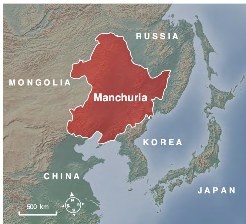
Figure 1. Geographical location and the range of Manchuria (shown in red)

to follow the strict instructions of the Japanese government, and it served as a testing ground for the future of education in Japan (Isoda, 1999). Manchuria, therefore, was not a simple colony, as the Japanese had to take into consideration other countries.