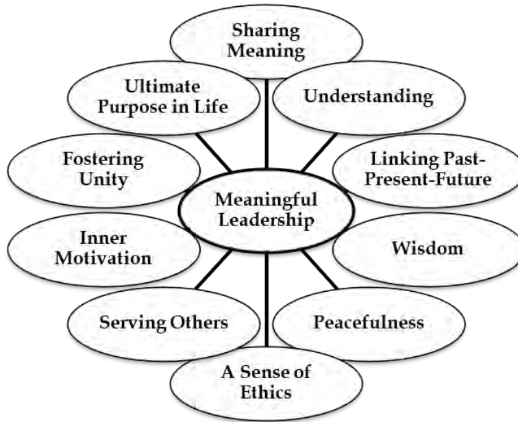
Figure 1 gives visualization to dimensions within meaningful leadership. Each of these qualities are explained separately below with “quotes” from the participants.

The dimensions of Meaningful Leadership based on participants' opinions