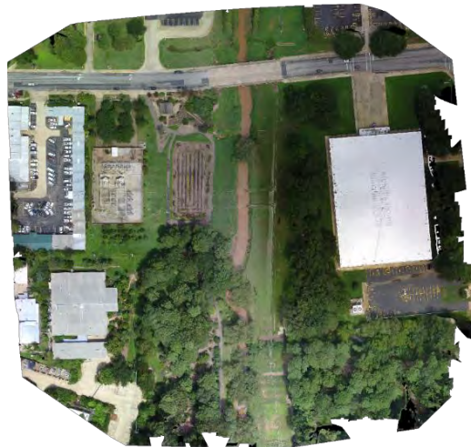
Figure 1. Drone derived orthophotomosaic of Jim and Beth Kingham Children's Garden

To assess the accuracy on height measurement, a total of 30 buildings were selected. Each was identified in LP360 and ArcScene for height measurement. In addition, the same buildings were identified and measured in Pictometry, which has been proved with satisfactory accuracy in measuring height. Finally, each building was measured in situ using a height measuring rod to obtain actual height. By calculating the root mean square error (RMSE) for each remote measurement approach, the accuracy was assessed and compared between the three, LP360, ArcScene, and Pictometry. Furthermore, an analysis of variance (ANOVA) was conducted to determine if there is significant difference on the mean absolute error among the three height measurement methods.