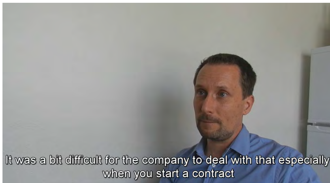
Figure 3. A social worker shares his experience from the field in a video created by the French team ‘Association Transfer’

The narrator shares the story of a female employee in a French company (the names of which are not disclosed), who after an initial ‘good start’ appears as if she has faked sickness. Apparently, according to the narrator, the company makes an ‘attribution error’ (he uses this psychological term), by failing to recognize the employee’s health condition. The narrator goes on to say that the reaction of the employer was to state that ‘this person [the worker] doesn’t work anymore’ (2 min 20 sec), that ‘she is not reliable’ (3 min 36 sec) and ‘if it happens again she will lose her job’ (3 min 42 sec). He describes his role in the situation as ‘to demonstrate that we can’t judge those situations at first sight’ [sic] (3 min 25 sec). He explains the emotions of the employee, who probably faces ‘a number of practical stressors’, like ‘caring for dependents, having her sense of self-reliance compromised, acquiring the identity of a sick person’, and so on. According to the narrator, the employee ‘felt carried’ (4 min 25 sec) ... in the procedure to materialize and prove the fact that she is in a situation that she cannot handle’ (4 min 29 sec).