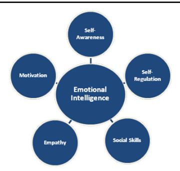
Figure 1: Constructs of Emotional Intelligence

The concept of emotional intelligence has been defined by different models; ability model, mixed model and trait model (Tyagi and Goutam, 2017). According to the ability model, emotional intelligence is defined as the ability to observe emotion, integrate emotion to check thought, understand emotion and regulate emotion to promote personal growth. According to the mixed model which was developed by Daniel Goleman, emotional intelligence includes a group of a wide range of competencies and skills that drive the performance of the individuals. According to Cherry (2018), "emotional intelligence refers to an individual's capacity to understand and manage emotions". It also includes the chief five components. This mixed model of emotional intelligence is based on the following five constructs; self-awareness, selfregulation, social skill, empathy, and motivation.