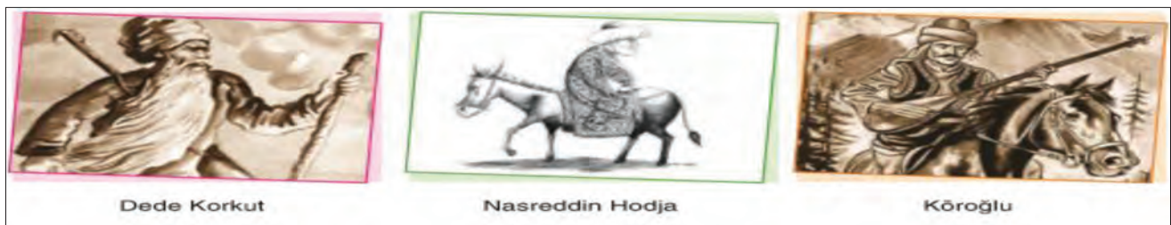
Figure 3. Samples from 10th grade English Lesson's textbook