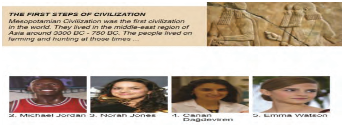
Figure 2. Samples from 9th grade English Lesson's textbook