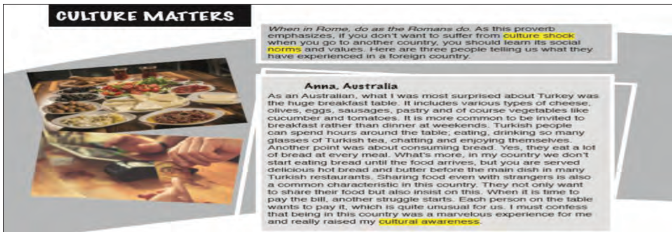
Figure 4. Samples from 11th grade English Lesson's textbook