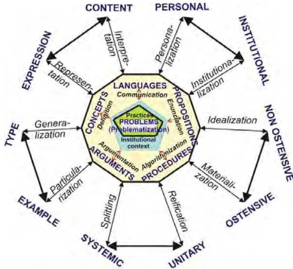
Figure 1. Onto-semiotic configuration of practice objects and processes.

figure 1 are considered in the psychological and educational literature, for example, problem solving and modeling processes, among others. Those processes can be described by using the proposed basic processes by the OSA, so they are treated as mega processes .