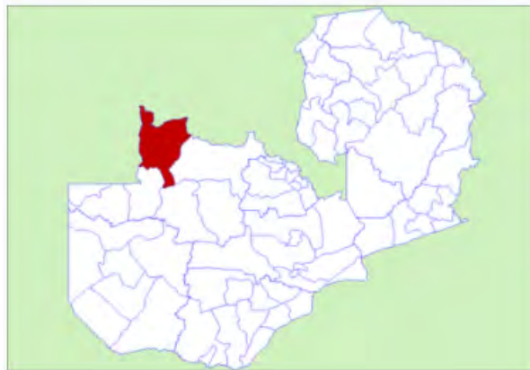
Fig. 1. Location of Mwinilunga District in Zambia

but wars, bad road conditions and various trade policies between the countries have so far prevented this. Zengamina is a small hydroelectric power generation plant near Kalene Hill in Mwinilunga (Peša, 2013).