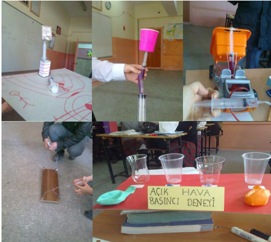
Figure 1. Images from the implementation process